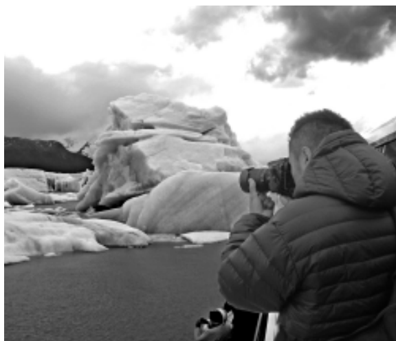
Patagonia's glaciers offer fantastic opportunities for photos, then it's time for a ham and cheese sandwich.

As we traveled through the country, on most of our excursions, hikes, and sight-seeing walks, a sack lunch was included. In the bags were an abundance of items—fruits, chips, salads, snacks and always, a ham and